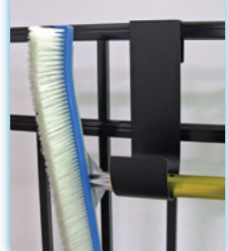
Our Fence Hook allows you to hang your pool accessories on a Jerith fence. Available in black only.